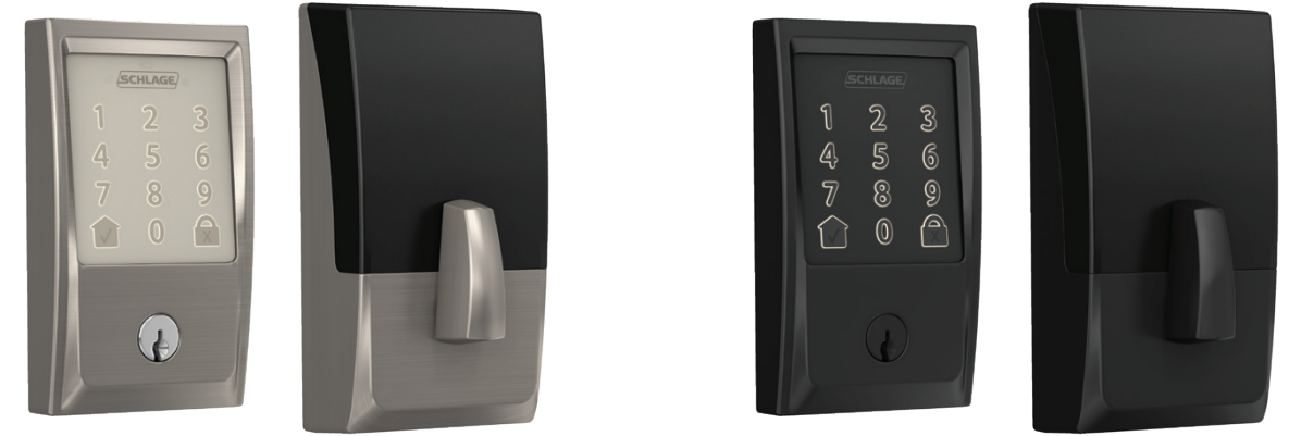
Century ● SNP