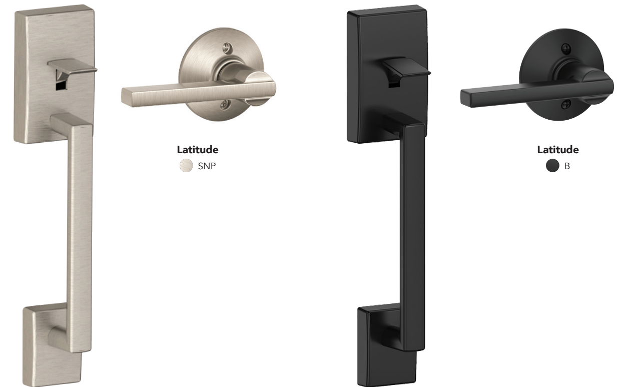
Latitude ● SNP